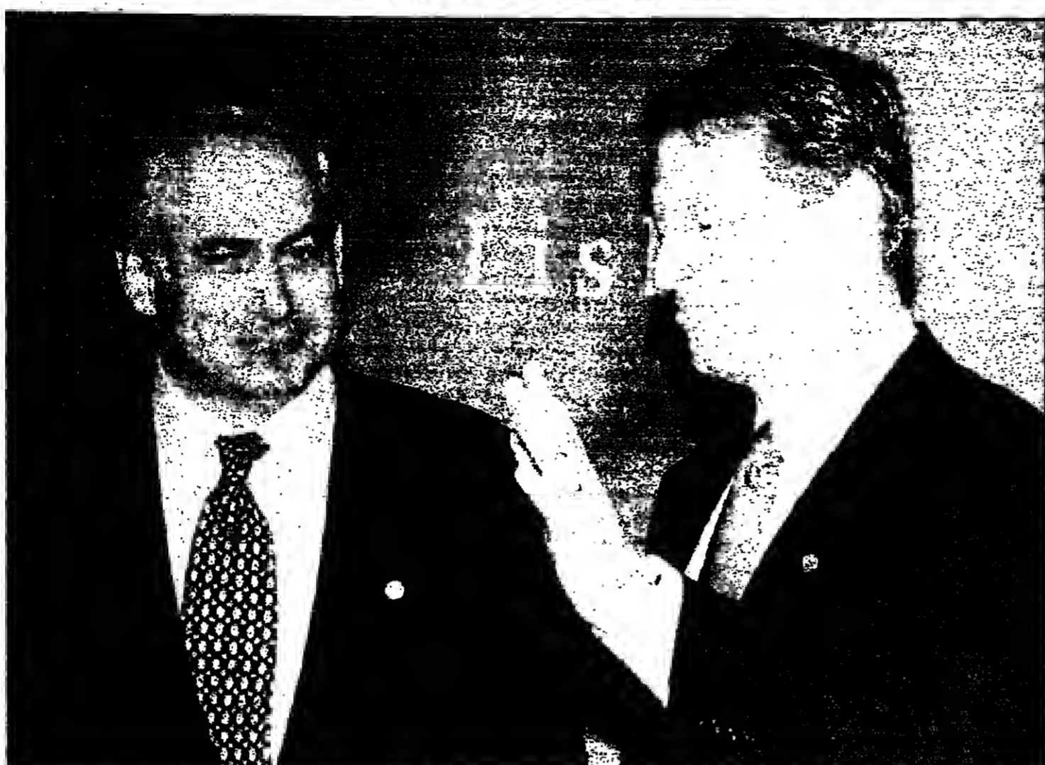
Prime Minister Binyamin Netanyahu and US Vice President Al Gore share a light moment at the CSCE meeting in Lisbon yesterday.